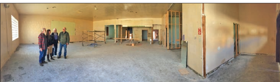
This photo from March 19, 2017 , shows the stripped-down former American Legion Hall, which was remodeled to house the Upper Skagit Library. A local benefactor bought the building in 2016, remodeled it (“for temporary use,” according to an Upper Skagit Library Task Force Report), then donated it to the library in 2017. From 2018 through February 2021, the library continued to remodel the space “for permanent use,” according to the report.