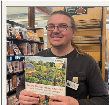
NO DIG ORGANIC HOME & GARDEN: GROW, COOK, USE, & STORE YOUR HARVEST - CHARLES DOWDING & STEPHANIE HAFFERTY - 635.048 DOW